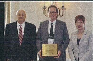
Paver of the Year Winners Dufferin Construction Company