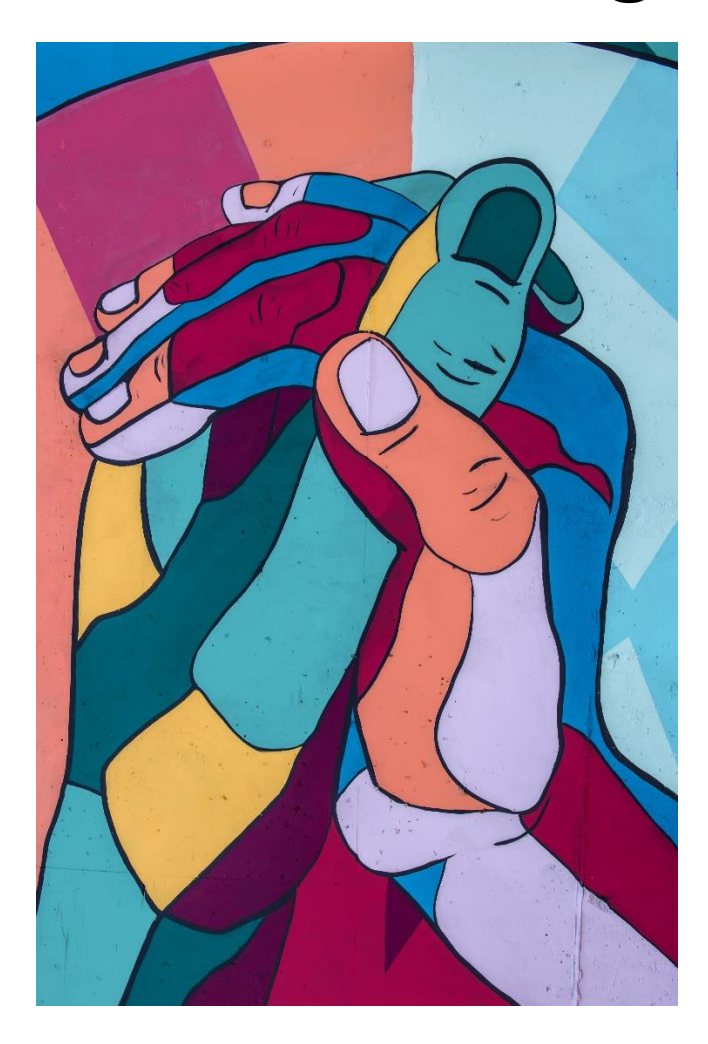
Diversity & Social Responsibility Plan