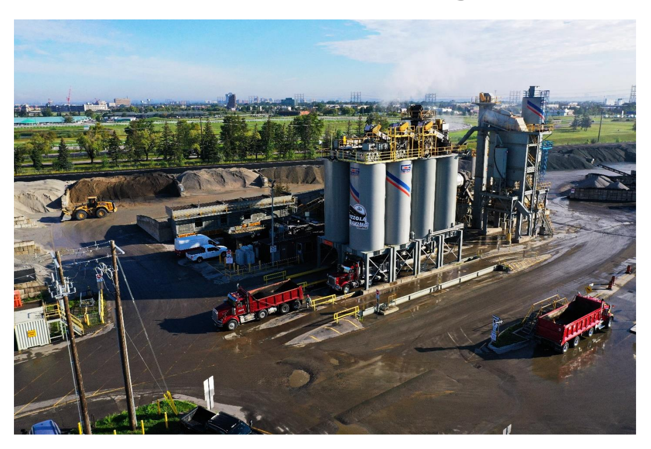
Environmental Management Plan